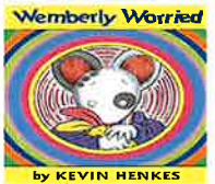
Wemberly Worried , by Kevin Henkes