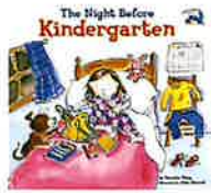
The Night Before Kindergarten , by Natasha Wing