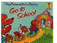
The Berenstain Bears Go to School , by Stan Berenstain